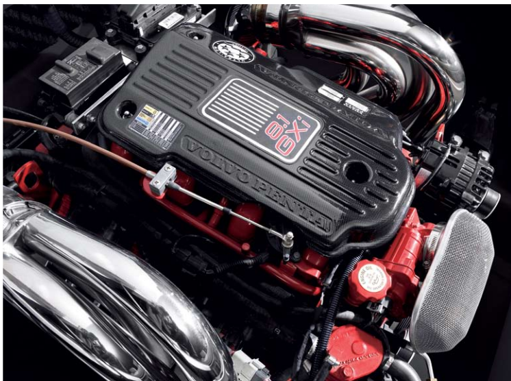
Cantiere Nautico Feltrinelli Tuning III